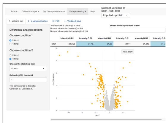
Figure 31: Volcanoplot of the differential analysis tool - 1