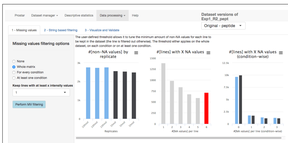
Figure 24: Interface of the filtering tool - 1

In this step, the user may decide to delete several peptides or proteins according to several criteria: If the amount of missing values is too important to expect confident processing (Tab 1); or if they are identified as reverse sequences (for target-decoy approaches) or contaminants (Tab 2).