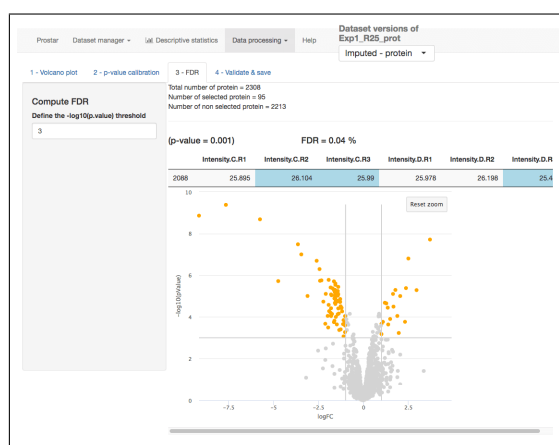
Figure 33: p-Value threshold of the differential analysis tool - 3

FDR (see Fig. 33): This tab also displays the volcano plot. A threshold along the p -value axis can be tuned by the user, so as to discriminate the differentially abundant proteins (which are highlighted). A horizontal straight line is drawn to visualize the threshold. The corresponding FDR is computed. The user can adjust the thresholds in order to select the maximum of proteins by minimizing the FDR.