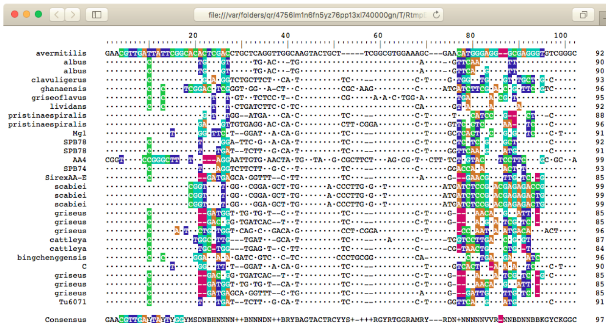
Figure 2: Amplicon with the target site for each primer colored

Then we can use the function BrowseSeqs to visualize the target site for each primer in the amplicon. This command will open a new window in the default web browser. The top sequence shows the target ( S. avermitilis ), and each primer's target site is colored. We can highlight the target sequence so that only mismatches are colored in the non-target sequences. It is clear why this target site was chosen, because all other Streptomyces species have multiple mismatches to both the forward and reverse primers. The non-target mismatches, especially those located nearest the 3' end (towards the center of the amplicon), will act to lower both hybridization and elongation efficiency of non-target amplification.