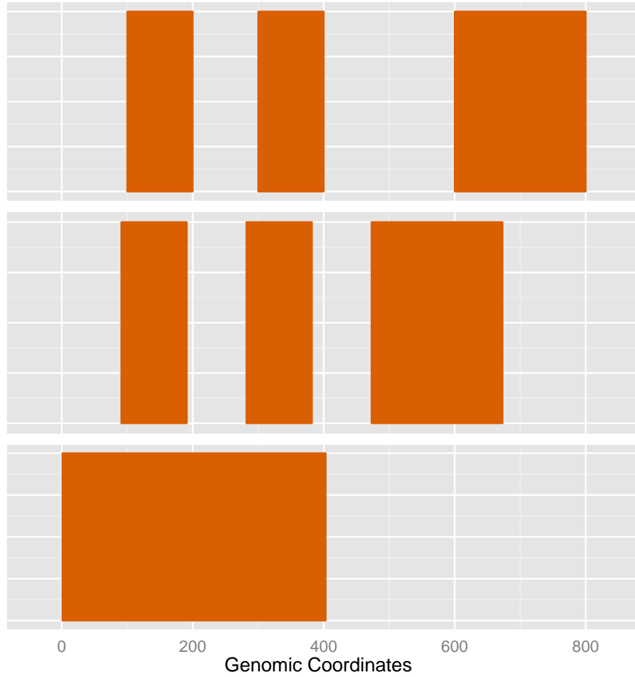
Figure 5: Shrink single GRanges. The first track is original GRanges, the second one use a ratio which shrink the GRanges a little bit, and default is to remove all gaps shown as the third track