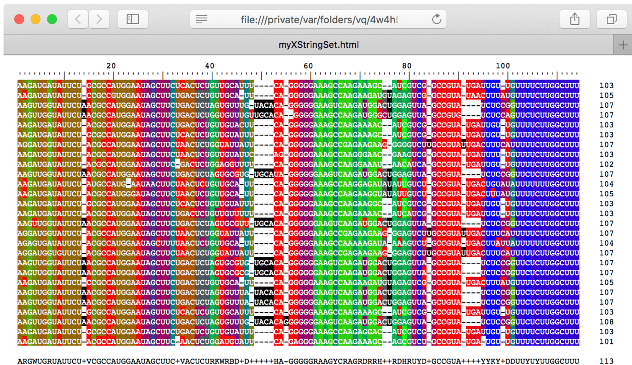
Figure 1: Predicted secondary structure of IhtA