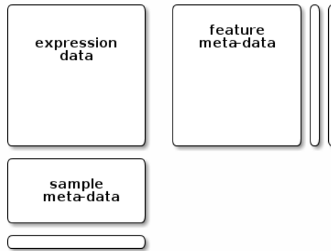
Figure 3: Dimension requirements for the respective expression, feature and sample meta-data slots.

create the expression data, while the others are used as feature meta-data. ecol can be a character with the respective column labels or a numeric with their indices. In the former case, it is important to make sure that the names match exactly. Special characters like '-' or '(' will be transformed by R into '.' when the csv file is read in. Optionally, one can also specify a column to be used as feature names. Note that these must be unique to guarantee the final object validity.